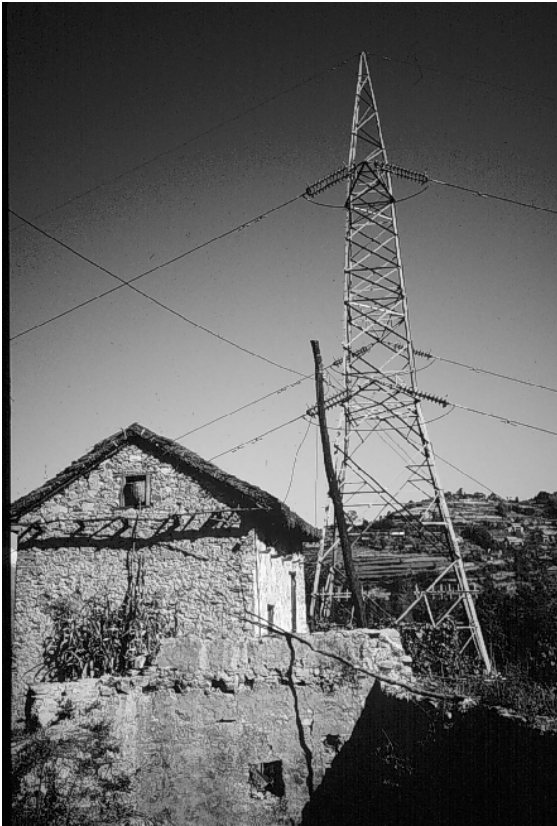
Figure 1: Grid system in a rural area

Heat from the sun can be concentrated to drive a steam turbine, or the more popular method uses the photovoltaic principle to convert sunlight directly into electricity. Solar and wind technologies are not used on a widespread basis for producing electricity which is fed into large grid systems, though examples do exist.